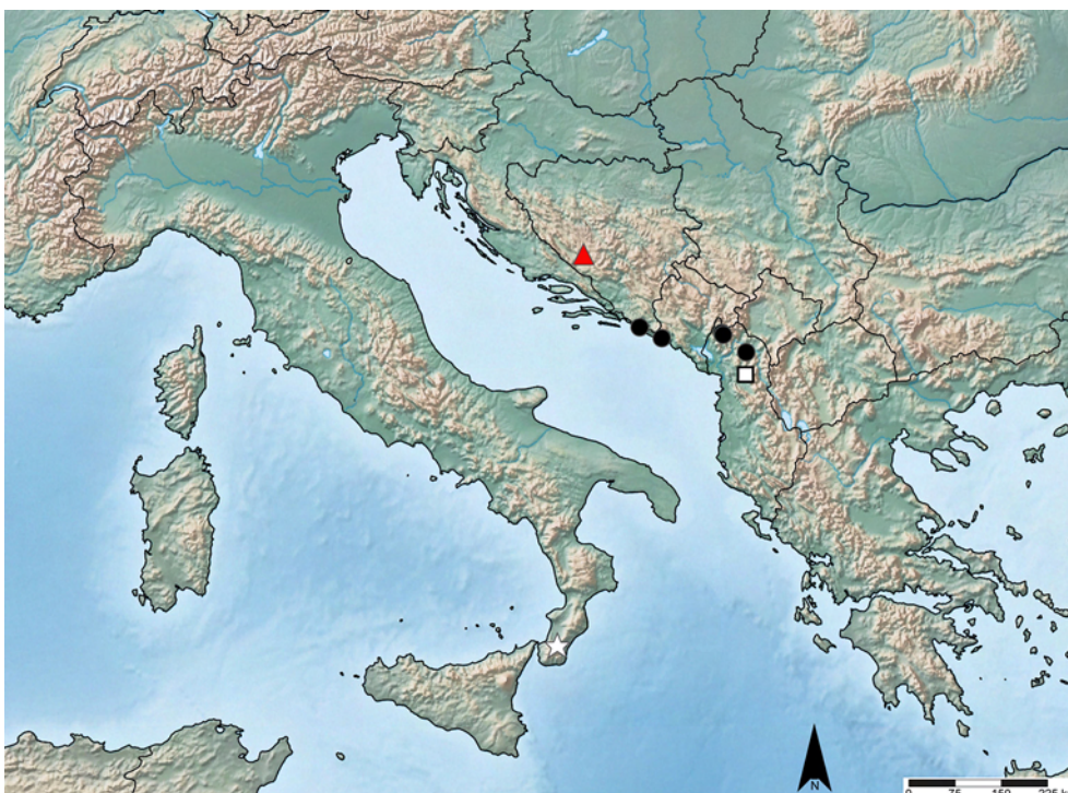
Fig. 4: Records of Xysticus brevidentatus on the Balkan Peninsula and in Italy. Red/grey triangle = new record from Bosnia and Herzegovina, black dots = records from Balkan Peninsula in the literature, white star = dubious record in Italy (Jantscher 2003). White square = record from “northern Albania” without exact location in Jantscher (2003), the symbol is set arbitrary.

Astrin et al. (2016) have shown that at least two species within the X. cristatus group ( X. cristatus (Clerck, 1757) and X. audax (Schrank, 1803)) are not separable on the basis of COI (barcode) sequences, which might be attributed to occasional hybridisation resulting in mitochondrial introgression between these very closely related species. Additional published barcode data in the BOLD database ( http://doi.org/10.5883/BOLD:AAP2437 ) show that the same COI haplotypes are also shared by X. gallicus Simon, 1875, X. slovacus Svatoň, Pekár & Pridavka, 2000 and X. macedonicus (e.g., X. macedonicus SPSLO281-12 from Switzerland identified by M. Kuntner, unpublished; X. gallicus GBMIN117776-17 from Greece and X. slovacus GBMIN117780-17 from Slovakia, reported in Gawryszewski et al. 2017: Suppl. Tab. 1). This indicates a considerable amount of genetic permeability of the species barriers in the X. cristatus species group.