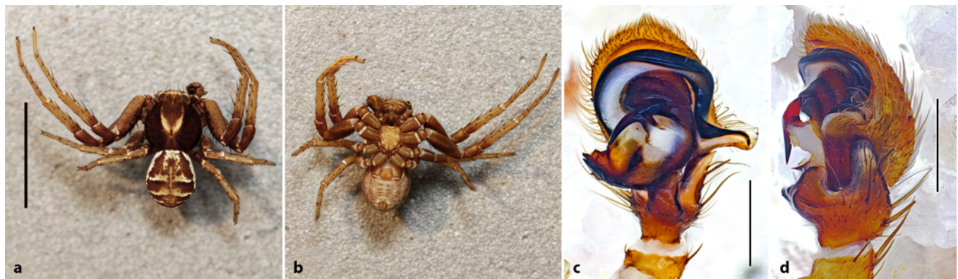
Fig. 2: Xysticus brevidentatus , male from Bosnia and Herzegovina. a. habitus dorsal view; b. habitus ventral view; c. pedipalp ventral view; d. pedipalp retrolateral view; scales: a, b = 5 mm, c, d = 0.5 mm

Based on the distribution reported in the literature, an occurrence of X. brevidentatus in Bosnia and Herzegovina was