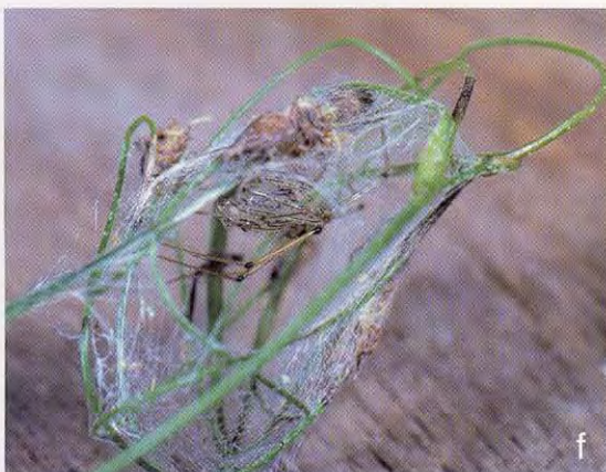
Plate 1. a) Thaumasia sp. (Pisauridae), a representative of the "ground ambusher" guild. b) Nops sp. (Caponiidae), a representative of the "litter stalker" guild. c) Otiotrops hoeferi (Palpimanidae), another representative of the "litter stalker" guild. d) Cupiennius celerrimus (Ctenidae), a "nocturnal aerial ambusher". e) Olios sp. (Sparassidae), another representative of the "nocturnal aerial ambusher" guild. f) Scytodes sp. (Scytodidae), a spitting spider in its retreat. These spiders hunt stalking around and were included in the guild of "nocturnal aerial runners".